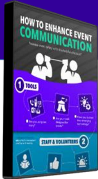
Enhance Event Communication Checklist [infographic]