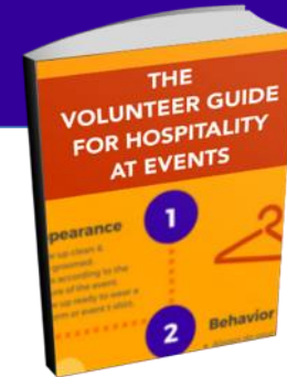
The Volunteer Guide for Hospitality at Events [infographic]