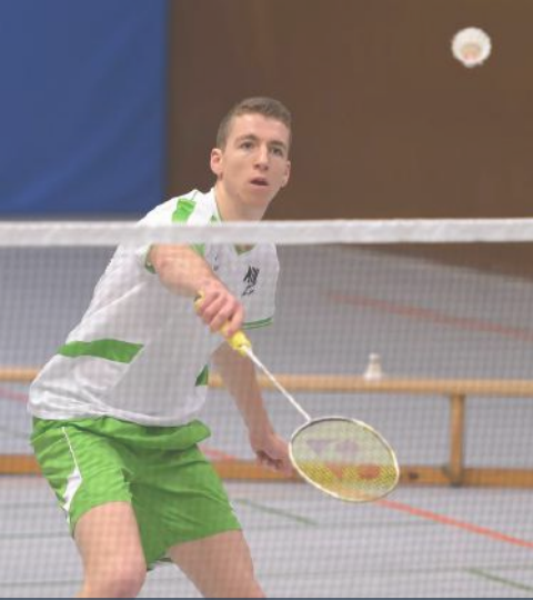
Badminton Canada started 2014