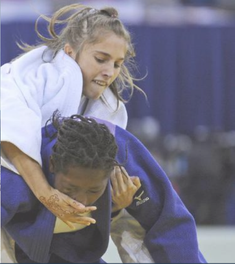
Judo Canada started in 2014