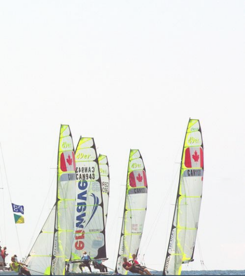
Sail Canada since 2012