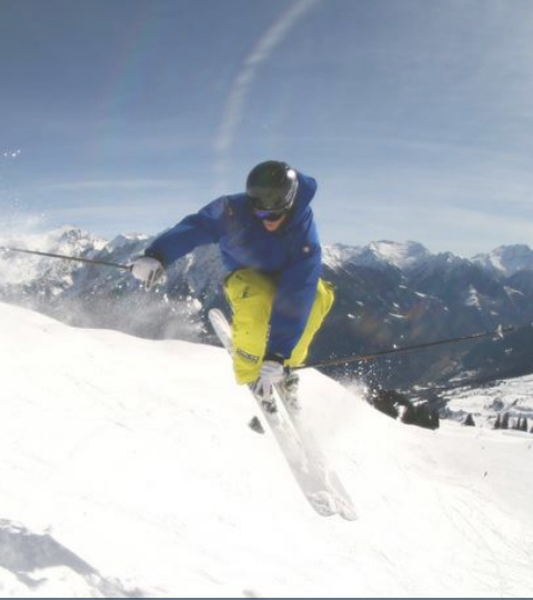
CFSA started in 2014