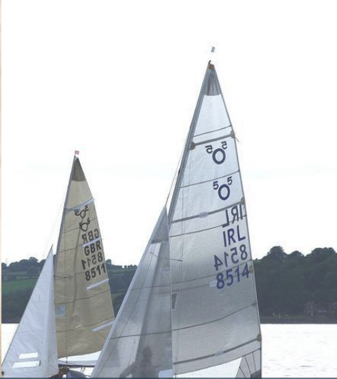
Irish Sailing starting in 2015