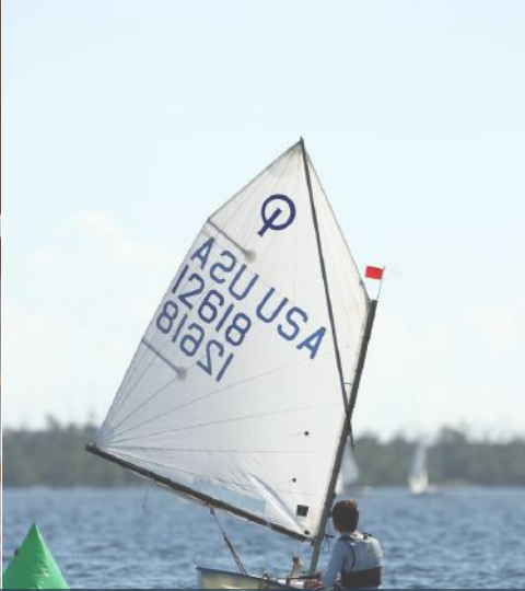
US Sailing started in 2014