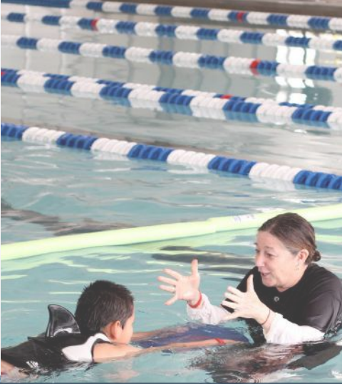
Red Cross Swim started in 2014