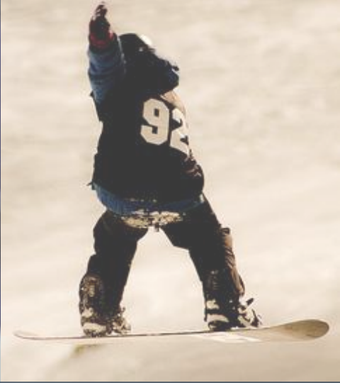
Canada Snowboard starting 2015